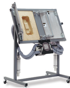
Twin Vertical Molding Station

Our Instapak® foam-in-bag molding equipment produces specifically shaped cushions for products that require the consistent, precise fit of engineered protection. Whether you are packing 20 or 2,000 products a day, we have a molding system to fit your needs.