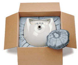
Blocking and Bracing