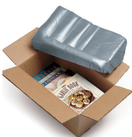
Protective Void Fill