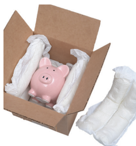
Continuous Foam Tubes